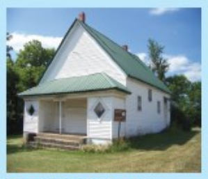
Filnt Hill School Location: Northwest corner of Farm Roads 123 and 54, north of Willard