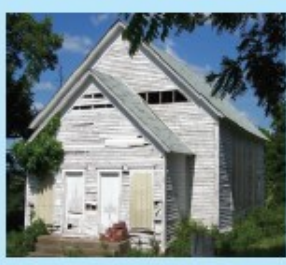
Willey School Location: Southeast corner of Farm Road 44 and Hwy. Z, north of Willard