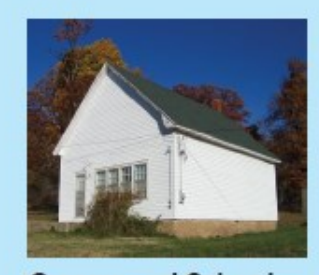
Greenwood School Location: 1300 block of Greenwood Road, Webster County. Take I-44 from Springfield east to Marshfield. Take Northview (Hwy. B) exit and turn left. Go across the overpass, turn right on to Cologna Road. Take the first road to the left, Greenwood Road. The school is on the left. Current use: community, club events