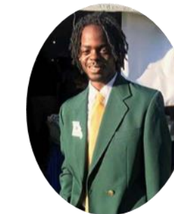
State Representative Darius White