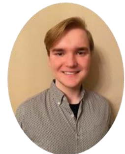
State Representative Troy Ludwig