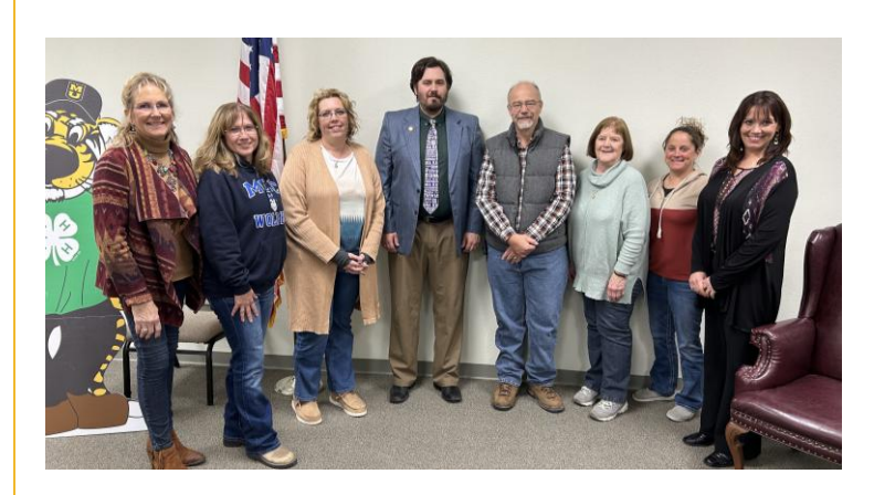
Carroll County Extension Council members attending the 2024 Annual Dinner