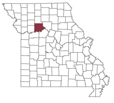
County population: 8,513