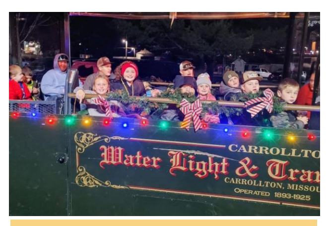
Above: Carroll County club members enjoying winter holiday celebrations with friends and community members. Below Left: MU Extension booth at the Carroll County Fair, including a Poison Look-a-Like Educational display. Below Right: First Friday MU Extension booth with interactive health activities.