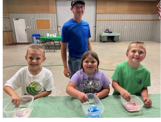
Above: Carroll County Clover Kid Day Camp attendees and 4-H member volunteer

The Carroll County 4-H Council applied for and received several 2024 grants: 4-H Foundation $2,500, Goppert Financial Bank $8,000, MFA Foundation $2,000 and Farm Credit Services (FCS) $500 for improvements to the 4-H Youth Building and to update the incubators and other learning displays for Embryology.