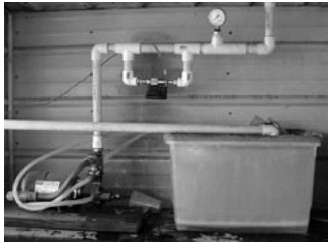
Figure 1. Indoor oil reservoir.

The nozzles should be located at least 10 inches from the roof and oriented to distribute the oil in a fan-shaped application area. With tunnel ventilation, the spray pattern will be somewhat skewed due to air flow. This configuration will allow each nozzle to apply oil to a pair of pens, primarily in the sleeping/laying areas of the pen. This will adsorb dust particles in these areas and allow the pigs to distribute the oil throughout the