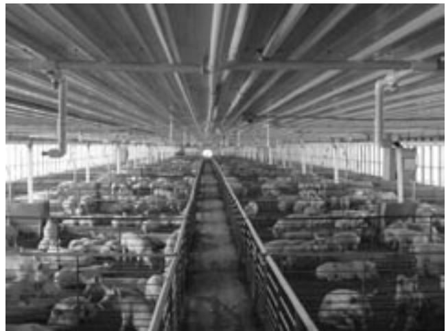
Figure 2. Oil distribution piping and nozzles.