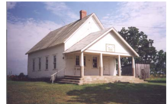
Locust Prairie School north of Strafford, Mo.

ORDER YOUR COPY FROM GREENE COUNTY UNIVERSITY OF MISSOURI EXTENSION