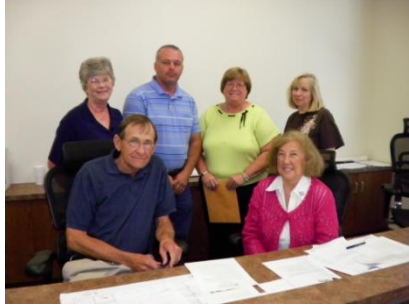
Commissioners Sign Proclamation