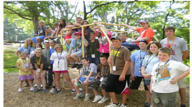
Heartland 4-H Campers from Stoddard County