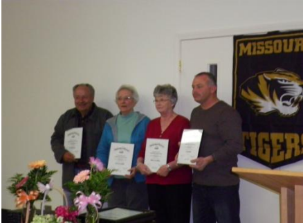
MU Honors Roll Recipients