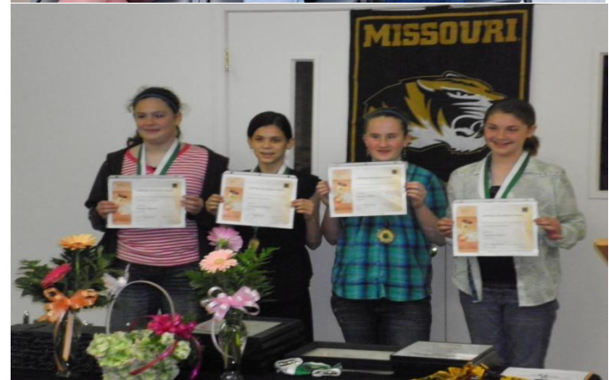
State Level II Winners – Camp Scholarships