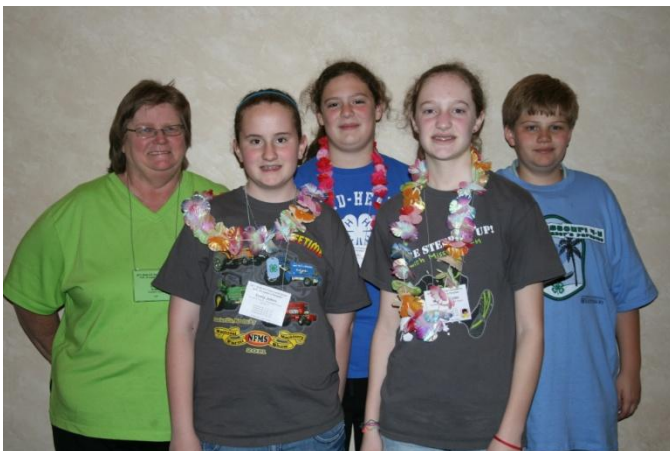
State 4-H Teen Conference