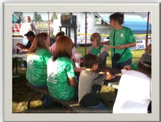
Buyers Breakfast at the Fair

An official "livestock showmanship" class was completed in early September for youth enrolled in beef, swine, sheep and goats.