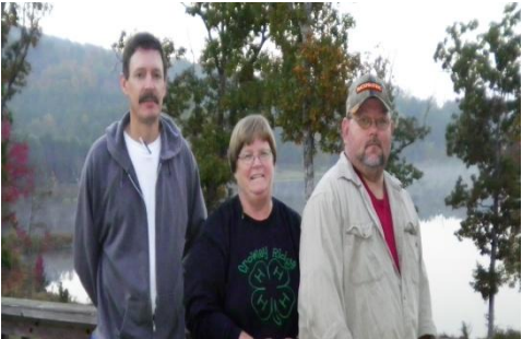
Leaders being State Certified