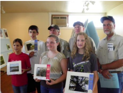
Swamp Friends Photo Contest