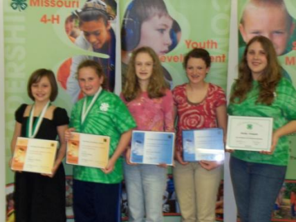
State 4-H Award Recipients