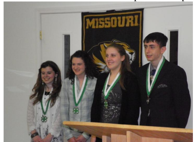
State Level III Winners – State Congress Recipients