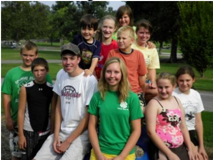
Summer Fling Daze