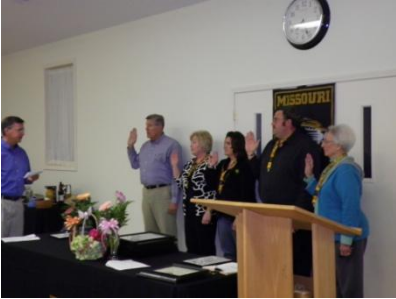
New council members