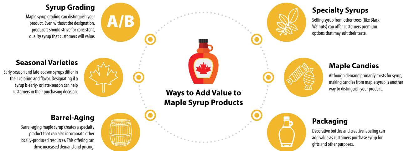
Figure 2. Examples of ways to add value to maple syrup products.