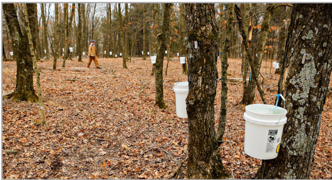
Figure 1. Survey respondents produced 480 gallons of syrup in 2022.

This guide aims to assist existing and new tree-sugaring enthusiasts with an interest in selling locally-made syrup by covering the basics of product marketing. The guide is structured around four marketing principles: product, pricing, place and promotion.