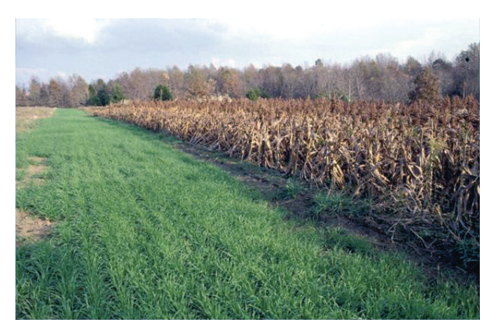
Figure 7. Plots can be planted with a grain crop and a cool-season forage such as winter wheat and clover. Larger plots have a better chance of withstanding heavy browsing pressure.