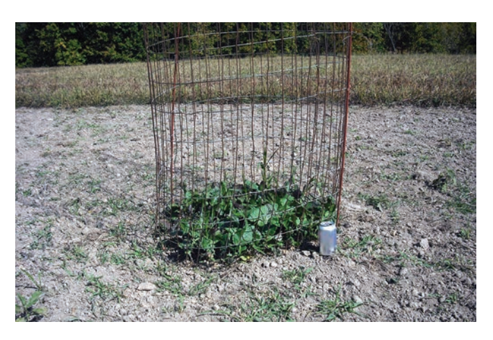
Figure 12. Exclosure cages are easy to construct out of 2-by-4-inch-mesh welded wire and a T-post, and provide a way to monitor browse pressure.