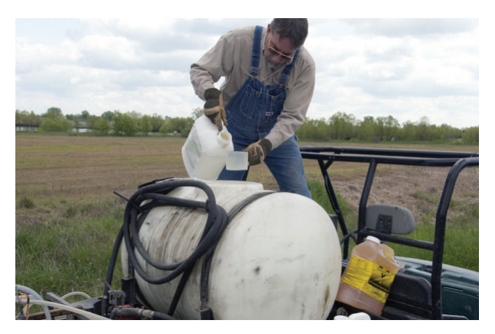
Figure 11. Weeds may need to be controlled with herbicides to prevent them from competing with forages.

Controlling competing vegetation is a recommended management practice. Grasses are generally not considered to be a preferred food for deer in the summer, so various grass-selective herbicides may need to be applied as a postemergence application in broad-leaved warm-season