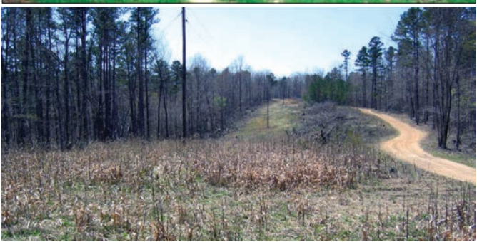
Figure 2. Woodland openings, logging roads and right-of-ways provide excellent locations for establishing food plots.