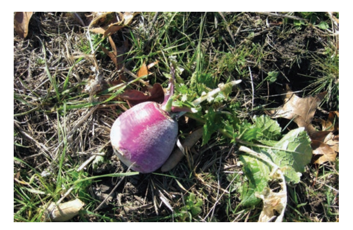
Figure 9. Plants in the Brassica genus, including turnips (pictured), rape, radishes, kale and canola, can be used in food plots.

The use of cool-season perennial forages in various mixtures can be beneficial. Perennial clovers and many