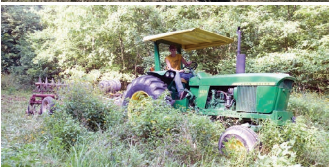
Figure 5. Consider what equipment and implements are available when planning a food plot, as they can affect the plant species that can be successfully planted, as well as the size and location of a food plot. For example, remote plots can be inaccessible for some equipment, such as large tractors, planters and other implements.

more beneficial for deer. Smaller food plots can be useful but tend to produce less forage due to browsing pressure and shading. Food plots larger than 5 acres can be designed with corridors or hedgerows of trees planted at 50-yard intervals to create visual breaks and provide screening cover (Figure 4).