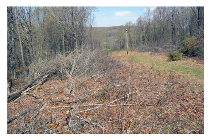
Figure 3. When establishing a food plot along a woodland edge, locate it 30 to 50 feet from the tree line and conduct edge feathering practices to allow a soft edge and transition zone of forbs, shrubs and vines to develop around it.

Areas where deer travel and areas near habitats that provide protective cover are ideal locations for food plots. Food plots can also be established in woodland openings