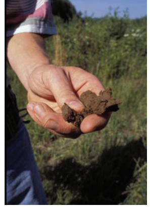
Figure 10. Collect samples and have the soil tested to determine fertility needs of area before establishing a food plot.

Potassium helps plants regulate water, absorb nitrogen, perform photosynthesis and transport nutrients. This important nutrient also increases root