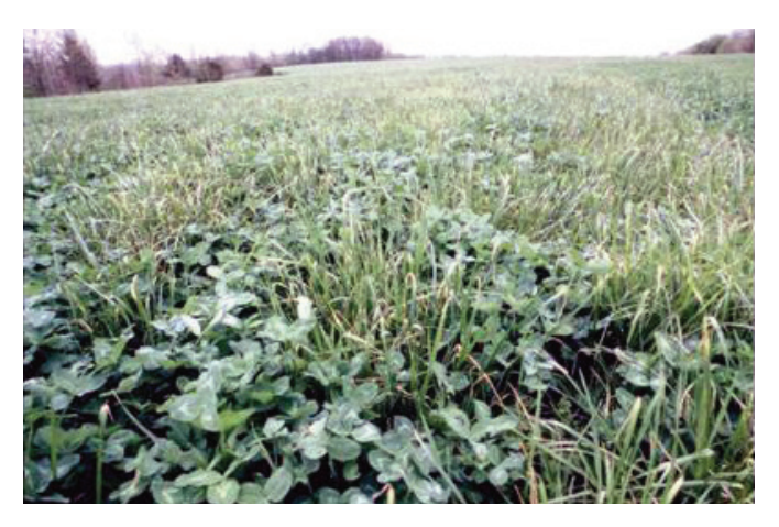
Figure 8. Adding legumes, such as various species of clover, with plantings of winter wheat or oats can provide a nutritious source of food during fall and winter.

food plot forages — such as clover, winter wheat and rape — grow during the fall and spring when temperatures are cooler. These forages provide sources of quality nutrition when other foods may be limited. They help bucks recover from the stress associated with breeding season and can increase hunting opportunities on the property. Annual grains such as winter wheat or oats planted alone or with various clover varieties will provide a source of nutritious foods during the late fall and winter (Figure 8).