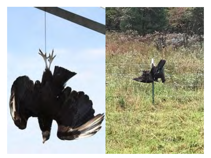
Figure 5. Effigies (dead vultures) can be used an an effective means to deter black vultures from an area. It's very important to make these effigies as highly visible as possible.