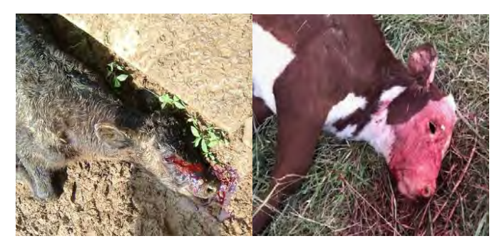
Figure 6. Characteristic damage and injuries caused by vultures can be observed on livestock. Black vultures typically will begin to depredate a carcass by pecking out the soft body parts of an animal, such as eyes, nose, rectal and mouth linings.

as it may be difficult to determine whether the black vultures killed the livestock they are feeding on or are feeding on already dead animals. Remove the animal from the area to ensure other vultures or wildlife species do not continue to feed on the carcass.