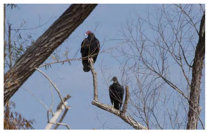
Figure 4. Black vultures roost in groups of birds that often include turkey vultures, especially during the winter months. Roosts can vary in size and become fairly large in some circumstances.

When a vulture kills an animal, there is generally large amounts of blood at the scene. Often vultures are blamed for killing animals that are already dead. If there is no blood at the scene then it is likely that the animal was already deceased prior to the arrival of vultures.