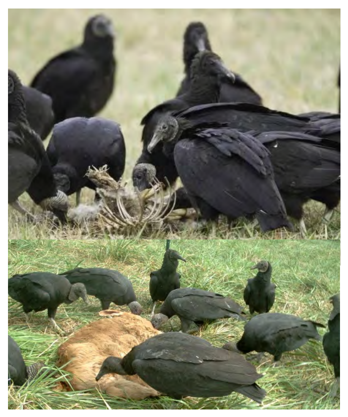
Figure 3. Black vultures use visual cues to locate carrion (dead animals) or to depredate livestock or find other food sources.

Although black vultures prey on livestock, the actual number of attacks is difficult to determine. Many incidents most likely go unreported. Sometimes determining whether black vultures are the culprit can be difficult to determine.