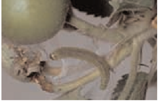
Figure 21. Leafroller larva among fruit cluster.