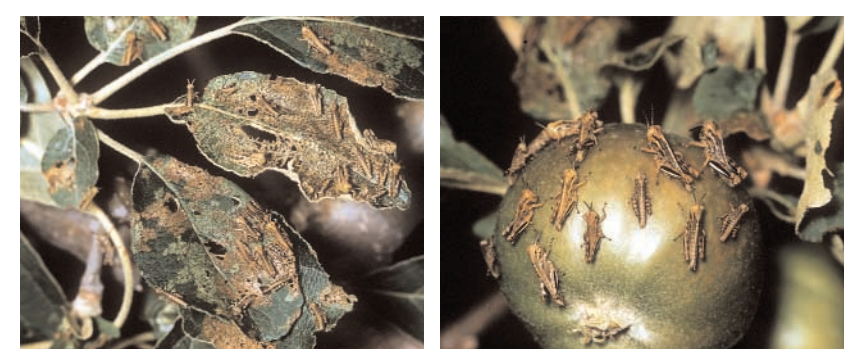
Figure 62. Young grasshoppers feeding on foliage (left) and fruit (right).

The occurrence of grasshoppers at damaging levels in commercial apple orchards is not too common primarily because of the regular use of insecticide sprays in such orchards. However, in the "backyard" orchard where sprays are usually not applied as frequently, and coupled with a hot, dry season, grasshopper populations can rise to levels that may cause severe damage. Large populations of grasshoppers can skeletonize the leaves (Figure 62) and eventually strip the lower branches of all foliage. They may also cause surface feeding damage on developing fruit and scar the bark. Grasshoppers lay their eggs in the ground as deep as 3 inches. In late spring, the young "hoppers" hatch as soon as the soil becomes warm.