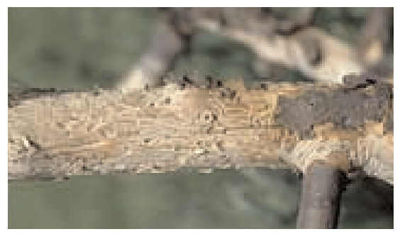
Figure 56. Galleries of the shothole borer beneath the bark.

capable of flying long distances. There are usually two or more generations each year.