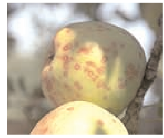
Figure 28. Fruit infested with San Jose scale.

The San Jose scale feeds on plant sap with long needle-like mouthparts, and can be found on the twigs, branches, and fruit of apple trees. Twigs and branches heavily infested appear to be coated with wood ashes (Figure 27). On fruit, red spots develop around the scales (Figure 28). In high populations it can contribute to an overall decline in tree vigor, growth, and productivity. The San Jose scale is a tiny insect that spends most of its life underneath a waxy covering it secretes (hence the name of "scale"). In the spring, during the apple bloom and petal-fall periods, small, winged adult males begin to emerge from their waxy coverings and seek out females (Table 1). The mature female's round waxy covering is about 1.5 mm across, gray-brown in color with a tiny yellowwhite dot in the center. The female's yellow body is legless and wingless. About 4-6 weeks after mating, immature scale nymphs called "crawlers" begin to emerge from underneath the female's covering and move about the tree looking for a suitable site to settle and begin feeding. Crawlers are yellow in color with short antennae and six legs. Crawlers can be distinguished from mites,