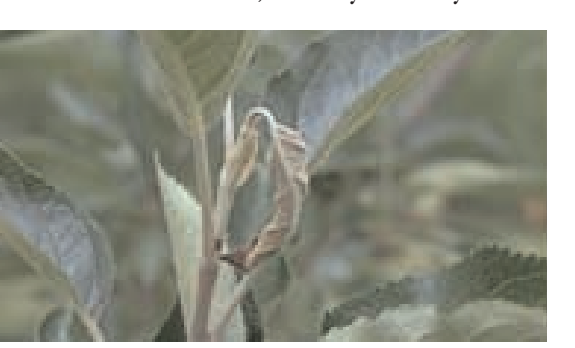
Figure 7. Wilted apple shoot tip caused by burrowing Oriental fruit moth larva.

overwinters as a mature larva in a dense silken cocoon found under loose bark or in debris underneath the tree (Figure 5). They can also overwinter in picking crates left in the orchard, in bins of culled fruit, and in other protected sites in and around packing sheds. There are three adult flights of codling moth in Missouri.