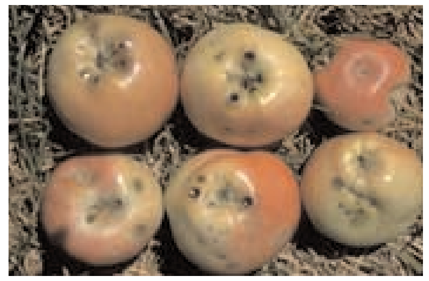
Figure 14 . Plum curculio feeding and oviposition activity in the spring can result in misshapen fruit at harvest. Note the late-season feeding holes on the fruit too.