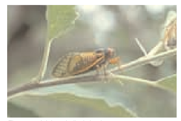
Figure 58. Adult periodical cicada.

There are two common types of appleinfesting cicada in Missouri, the periodical cicada and the annual cicada (both with several species). Cicadas are heavy-bodied, wedge-shaped insects that have large compound eyes and membranous wings held rooflike over the body. Annual cicadas are larger than periodical cicadas. They are often dark green to blackish in color with green margins on the wings. There may be lighter markings on the thorax and abdomen (Figure 57). Their life cycle lasts 2-5 years, but because of overlapping generations, some adults appear every year, usually July through September (Table 1). Periodical cicadas are the most damaging species for apples. Adults are 19-38 mm in length. They have a brownish black body, unspotted from the top, and reddish colored eyes, legs and wing veins (Figure 58). There are six species of periodical cicadas, three with a 17-year life cycle and three with a 13-year life cycle. Broods of cicadas are groups of individuals that hatch and mature at about the same time. Table 2 provides the occurrence and state distribution of the five confirmed