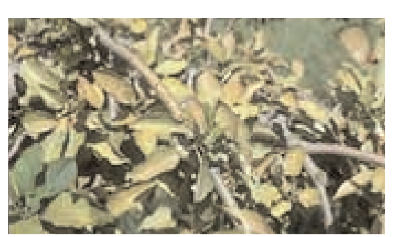
Figure 31. Apple leaves discolored (bronzed) by mite feeding. Note rich green uninfested foliage in bottom left.

tive dark spots on the back of her body. The adult female will overwinter in plant debris beneath the tree. This mite species becomes active in the spring during the half-inch green stage of apple leaf development but will often stay in the ground cover feeding and reproducing on weeds and grasses until midsummer (Table 1) when it begins moving up into the apple trees. During the fall most adults will leave the trees and overwinter in plant debris on the ground. There are several mite generations each year.