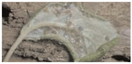
Figure 39. Rosy apple aphids.

Aphids are small, soft-bodied insects that can be found, depending on the species, on almost any part of the apple tree. Aphids are about 3 mm long, winged or wingless, and vary in color from light-green, yellow-green, reddish brown to black. Three of the most common aphid species that infest apples are the rosy apple aphid , the green apple aphid, and the woolly apple aphid. Aphids have piercing-sucking mouthparts and consume large quantities of plant sap. Both the rosy apple aphid and the green apple aphid feed on the underside of leaves, causing the leaves to curl (Figures 38, 39). In high aphid infestations, the fruit will be small or distorted at harvest. In addition, large quantities of aphid "honeydew" (waste product) can be produced that can coat both the foliage and fruit and act as a medium for