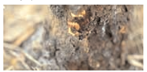
Figure 44. Exposed dogwood borer larva feeding beneath the bark surface.

mature larva is about 15 mm long, white to cream colored with a pale brown head. As the larvae feed, reddish brown frass is pushed to the surface of the tunnel (Figure 45). A feeding tunnel may be as much as 19 mm deep. As the burrknot tissue is consumed, the larvae will move outward and begin to feed on the cambium layer of healthy bark. Overwintering is done in the larval stage in the feeding tunnel. In the spring, the larva resumes feeding. Before pupation the larva will construct a tough silken cocoon covered with bits of frass. After adult emergence the empty pupal casing often remains protruding from the surface of the burrknot (Figure 46). There is usually one generation per year.