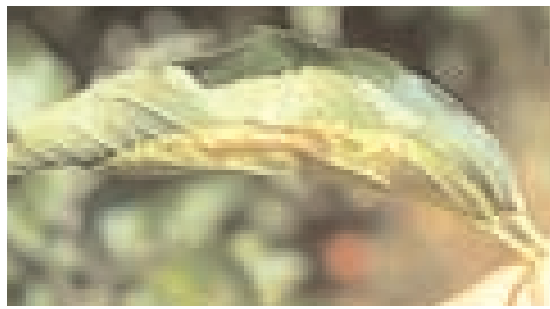
Figure 19. Leafroller leaf shelter.

Several species of leafrollers can be serious apple pests in the Midwest. The larval stage of leafroller moths are caterpillars that spin silken threads to roll or connect leaves together to form a protective structure (Figure 19). If one pries apart a leaf shelter the larva will often squirm away rapidly, dropping to the ground or remaining suspended from a silk thread. Leafrollers become important pests when the larva attaches its leaf shelter to an apple where it then feeds on both leaf and fruit tissue (Figure 20), or when it lives and feeds within a cluster of apples (Figure 21). One of the most common species of leafroller occurring in apple orchards in Missouri and other parts of the Midwest is the redbanded leafroller (Figure 22). This species overwinters as a pupa on the ground or among plant debris under the trees. Soon after the green tip stage the adult moths emerge and begin laying egg masses