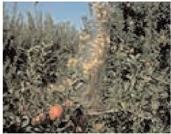
Figure 54. Fall webworm damage on apple tree.

populations, small to moderate-sized trees may be completely covered with webbing, which is most noticeable during the late-summer (Table 1).