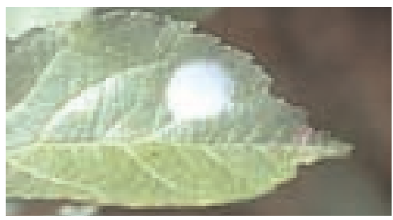
Figure 23. Redbanded leafroller egg mass (after hatch) on apple leaf.

apple buds are in the tight cluster stage, the larvae hatch and begin feeding on the opening buds (Table 1). Developing fruit fed upon by fruittree leafroller larvae will be badly scarred or lopsided at harvest (Figure 26). Maturing fruit that is attacked will have irregularly shaped feeding wounds that may be either shallow or deep. There