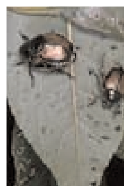
Figure 52. Japanese beetle adults.

copper-brown in color and the abdomen has a row of five tufts of white hairs on each side (Figure 52). These white tufts are a diagnostic characteristic of Japanese beetle. Adult beetles emerge from the ground in early June through September, with peak emergence occurring in late-June/early-July (Table 1). Females will mate and lay eggs immediately upon emergence. Eggs are laid in moist soil. The developing larvae, a type of "white grub," feed on organic matter and roots and will reach a size of 3 cm long. The grubs will overwinter and continue their development in the spring. There is one generation of Japanese beetle each year.