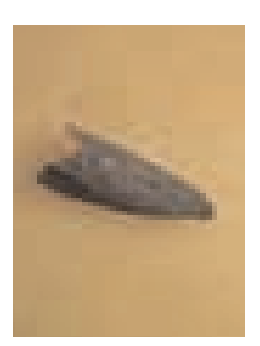
Figure 6. Adult Oriental fruit moth.

The Oriental fruit moth is often considered a primary pest of peaches but it can also be a serious pest of apples, and it damages apples in a similar manner as codling moth. The Oriental fruit moth is about 5 mm long and has indistinct dark/light wavy lines on its wings (Figure 6). In central Missouri, the adult moths emerge 4-5 weeks earlier in the spring than the codling moth (Table 1) and lay eggs near the terminal parts of rapidly growing apple shoots, often at the base of a leaf stem. The boring larva causes the stem to become wilted (Figure 7), and the larva's frass is often visible at the entry site (Figure 8). A larva may complete its development within the shoot. It has been observed that wilted shoots are most common during the first half of the season. When feeding on the fruit, the Oriental fruit moth larva does not appear to burrow to the core (as does the codling moth) but feeds primarily in the fleshy areas of the apple, sometimes just underneath the fruit's surface (Figure 9). Mature larvae are about 11 mm long, pinkish white in color with a blackbrown head. The larvae do not appear to always push their frass out of the fruit entry site like the codling moth. The difference in visible fruit damage between Oriental fruit moth and codling moth, while unique in some regards, can be too similar in most cases and should not be used as the sole diagnostic characteristic. Since the larvae of both moths are similar, the only sure way to dis-