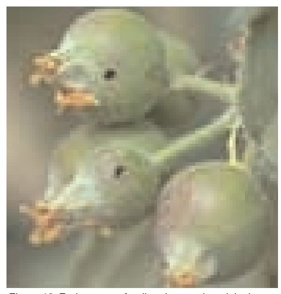
Figure 12. Early-season feeding damage by adult plum curculio.

ground in June or later. But if the egg fails to hatch or the larva dies, the fruit may not drop and the oviposition scar at harvest appears as a corky, bumpy area resembling the letter "D" (Figure 13). Fruit that is severely in the spring is misshapen and scarred at harvest (Figure 14). The adult beetles resulting from eggs laid in the spring begin emerging from the soil in mid- to late summer and return to the trees to feed on maturing apples. When cold weather arrives, the beetles seek out hibernation sites under fallen leaves and debris in woodland and fencerows near the orchard.