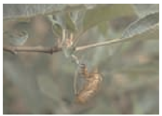
Figure 61. A periodical cicada shed exoskeleton attached to an apple leaf.

broods of periodical cicada found in Missouri. During infestation years, the adult periodical cicada begins to emerge in mid-May (Table 1). The female cicada uses a sawlike ovipositor to cut through the bark of small twigs and branches, and forms a pocket in the wood where she inserts eggs. She then will move forward, cutting a new pocket, and laying more eggs. This process may be repeated several times and may produce a con-