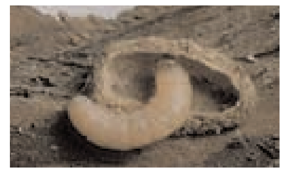
Figure 5. Overwintering codling moth larva and its thick silken cocoon (cut away to expose larva) found underneath bark.