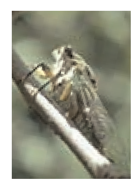
Figure 57. Adult annual cicada.

capable of flying long distances. There are usually two or more generations each year.