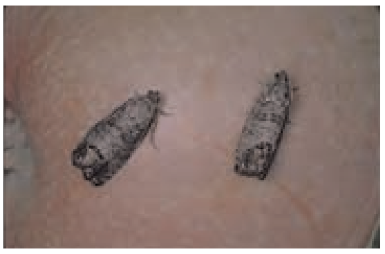
Figure 1. Adult codling moths.

The codling moth is a serious tree fruit pest that prefers apples and pears. Adult moths begin to emerge around the bloom or petal-fall stage of apple development (Table 1). They are about 9–12 mm long. The wings are gray in color with indistinct dark/light wavy lines that are bronze-colored at the tips (Figure 1). Eggs are laid primarily on leaf surfaces near the fruit. After the eggs hatch, the larvae bore into the fruit and begin chewing their way to the core, where they feed on the seeds (Figure 2), and they push their waste material (frass) out the entrance and exit holes. This type of damage is often referred to as deep entries (Figures 3, 4). Sometimes a larva will bore into the fruit a short distance and then either die or move