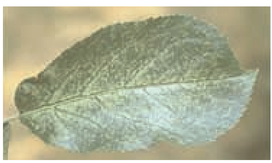
Figure 37. Apple leaf discolored by leafhopper feeding.

The white apple leafhopper is primarily an apple pest, but it can also occur on other tree fruits. Overwintering eggs, found just underneath the bark of twigs, begin to hatch during the apple pink to petal-fall stages of development (Table 1). The young nymphs move to the lower leaf surfaces and begin to feed. Their shed skins and tiny spots of black excrement are often visible (Figure 36). Leafhoppers, both nymphs and adults, have piercing-sucking mouthparts that remove plant sap and chlorophyll from the foliage tissue. The topsides of heavily infested leaves are covered with tiny white markings. The entire leaf may seem mottled or silvery in appearance (Figure 37) and, in high population densities, such damage may affect fruit set and size. Adults are about 3 mm long and readily jump and fly from