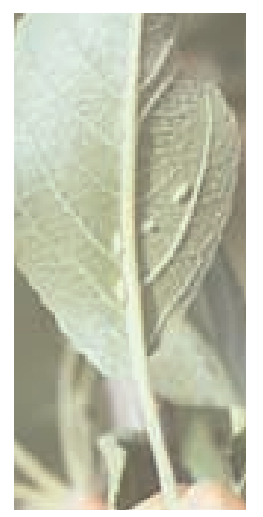
Figure 36. Leafhopper nymphs and cast skins.

referred to as a tissuefeeder larva (Figure 35). These older larvae begin to feed on the upper internal leaf tissue, resulting in light-colored spots visible externally on the upper leaf surface. The tissuefeeder larva spins silken threads within the mine, causing the mine to arch, becoming tentlike in shape (Figure 35). High infestations can lead to early leaf drop, reduced fruit and terminal growth, and reduced fruit set the following year. There are three to four generations of both leafminer species each year in Missouri.