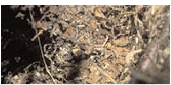
Figure 45. Reddish-colored frass of dogwood borer collecting at surface of damaged area.