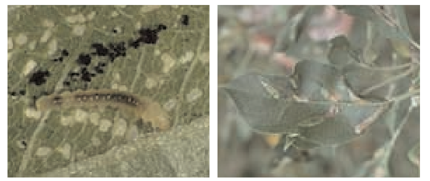
Figure 35. Older leafminer larvae are referred to as tissuefeeders (left), and they produce mines that are visible from both the upper and lower leaf surfaces (right).