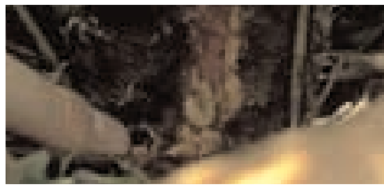
Figure 50. Bark and wood removed exposing a roundheaded apple tree borer larva.

loss of large portions of bark. Tunnels in trees can often be 7 cm long or more. As the larva feeds, it fills the tunnel with a powdery frass. Mature larvae are white, about 2.5 cm long, and slender, except for a broad, flat enlargement of the thoracic segments behind the head (Figure 48). During the fall the larva will bore deeper into the wood where it will spend the winter and pupate the following spring. There is one generation per year.