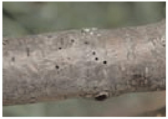
Figure 55. Entrance or exit holes of the shothole borer.

The shothole borer is usually a problem of weak and declining fruit trees, and infestations frequently hasten tree or limb death. The bark of infested twigs, branches, and trunks are perforated with many small round holes about the size of a pencil lead (Figure 55). The adult beetle is dark brown to black in color, blunt on both ends, and about 2.5 mm long. The tips of the antennae and legs are reddish brown. The wing covers are striated with rows of shallow punctures. Adults emerge in May (Table 1). The female beetle will bore through the bark and begin excavating a gallery (tunnel) at the wood/bark interface that is about 5 cm long and runs parallel with the wood grain. Along the gallery the female will lay several eggs. The hatching larvae will then form their own galleries (Figure 56). A larva is about 3 mm long, legless, white with a brown-red head, and has a slight enlargement of the body just behind the head. It will feed on sapwood for about a month. The mature larva pupates within its tunnel and, as an adult, will chew a round hole through the bark and emerge. The small holes found in the bark can be either entrance or exit holes. After emerging, adult beetles can reinfest the tree or seek out new host trees. Adults are