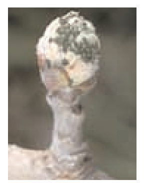
Figure 41. Newly hatched aphids feeding on bud.