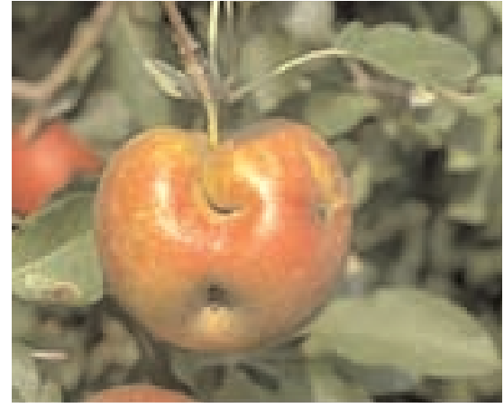
Figure 16. Misshapen fruit (catfacing) caused by earlyseason feeding activity of the tarnished plant bug.

A serious early-season pest of apples is the tarnished plant bug. The adults are about 6 mm long and 3 mm wide, and somewhat oval in shape and dorsoventrally flattened. Their color is mottled yellow and brown (Figure 15). Adults will overwinter in ground debris and become active early in the spring (Table 1). Their feeding on developing buds and flowers up to the tight cluster stage usually results in underdeveloped buds that fail to set fruit. Feeding activity on small, developing apples will result in deep depressions or dimples (catfacing) that are apparent at harvest (Figure 16). After the petal-fall stage, adults begin to migrate out of the trees to feed and lay eggs on other host plants (such as weeds).