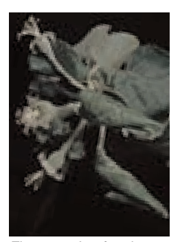
Figure 38. Leaf curl at petal fall due to aphid feeding.

the foliage when disturbed. At harvest, secondgeneration populations can build to such large numbers that the leafhoppers become a nuisance as they fly about the heads of pickers. The accumulation of leafhopper excrement on the fruit surface may also be a problem.