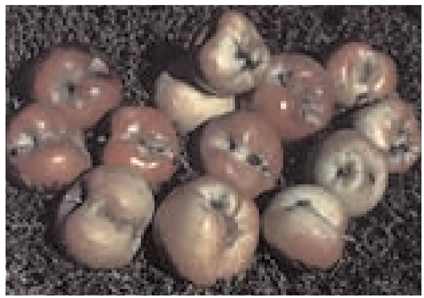
Figure 26. Spring feeding by fruittree leafroller larvae causes fruit deformation at harvest.

appears to be only one generation of fruittree leafroller each year in Missouri. Depending on the species, leafroller larvae range in length from 16 to 30 mm. The body color of most species is light to dark green, but the head color may vary. The redbanded leafroller larva has a pale green head, but the fruittree leafroller has a black head.