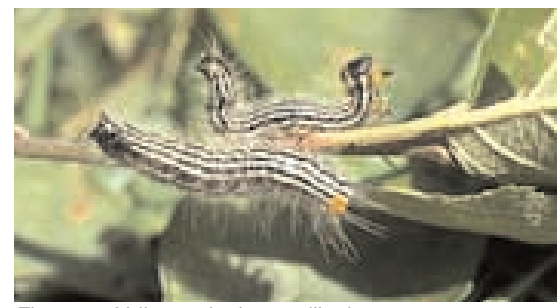
Figure 53. Yellownecked caterpillar larvae.

The yellownecked caterpillar feeds on the foliage of many fruit trees, including apple, as well as shade and forest tree species. Infested trees can be completely defoliated by mid- to late summer with serious injury occurring primarily to single, isolated trees. Defoliation appears first on the periphery of the canopy. During midsummer, adult moths emerge from the soil and lay egg masses on the underside of leaves (Table 1). The larvae may consume the entire leaf tissue except the petiole. Full-grown larvae are about 5 cm long and moderately hairy. The head is black; the "neck" region is bright yellow-orange in