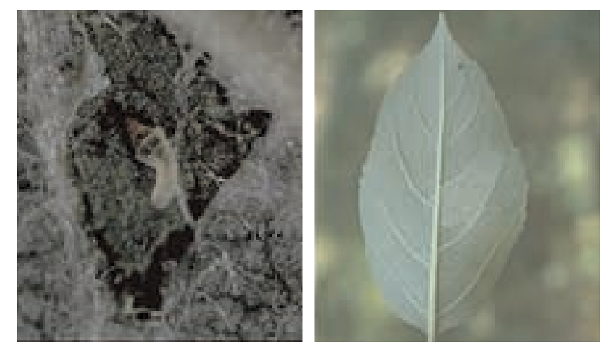
Figure 34. Young leafminer larvae are referred to as sapfeeders (left), and they produce mines that are visible only on the leaf's underside (right).