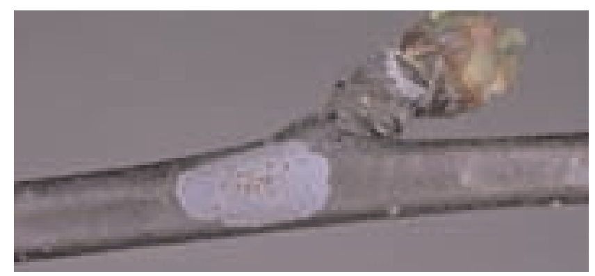
Figure 25. Overwintering fruittree leafroller egg mass (after hatch) on apple twig.