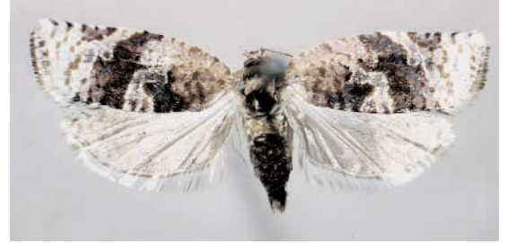
Figure 22. Redbanded leafroller moth.

apple buds are in the tight cluster stage, the larvae hatch and begin feeding on the opening buds (Table 1). Developing fruit fed upon by fruittree leafroller larvae will be badly scarred or lopsided at harvest (Figure 26). Maturing fruit that is attacked will have irregularly shaped feeding wounds that may be either shallow or deep. There