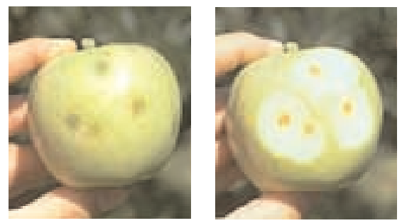
Figure 18. Stink bug feeding damage appears as sunken, dark areas on the fruit surface (left). Cells underneath the feeding sites have a brown discoloration (right).

Stinkbugs are another type of plant bug that can be damaging to apples. Stinkbugs are 12–18 mm long with a shield-shaped and somewhat dorsoventrally flattened body (Figure 17). Their color ranges from light brown to bright green. Adults overwinter in ground debris inside and outside of the orchard. From early to midseason, adults start to migrate into the orchard and begin feeding on the fruit (Table 1). Stinkbug feeding sites on mature apples appear sunken and dark in color, and beneath the skin the cells have a brown discoloration (Figure 18).