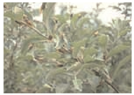
Figure 60. Mass of periodical cicadas in apple tree.