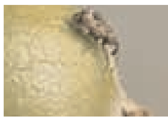
Figure 11. Adult plum curculio.

The plum curculio is a snout beetle about 4-6 mm long and colored with mottled patches of black, brown, and gray-white (Figure 11). The wing covers have four pairs of distinctive humps, with one pair being quite prominent. Adult beetles begin to migrate into apple orchards from their overwintering sites each spring during the bloom and petal-fall periods (Table 1). Earlyseason adult feeding damage on apples consists of small round holes about 3 mm deep (Figure 12). Oviposition damage is made as eggs are laid underneath a crescent-shaped chewed flap of the fruit's skin. The developing larva tunnels into the fruit flesh to feed. The larva is 6-9 mm long, white with a brown head, and legless. After 2-3 weeks in the fruit, the larva leaves and burrows into the ground to complete development. Fruit infested early in the season typically falls to the