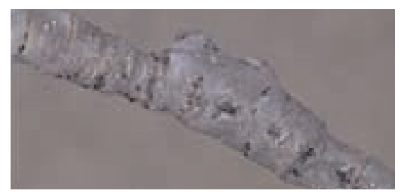
Figure 40. Clusters of overwintering aphid eggs on twig.