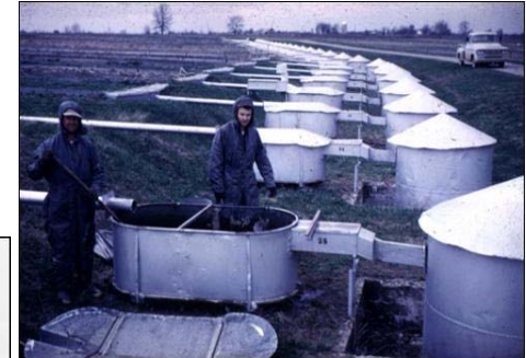
1917; M. F. Miller

Erosion control Source of organic matter Source of N Pest control, especially nematodes Compaction reduction Water infiltration