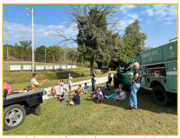
Youth absorbing information from a session at the Rural Safety Day.

The participating schools included Richwoods, Kingston, Potosi, and Caledonia. Teachers, students and administration were excited to see what the day had to offer.