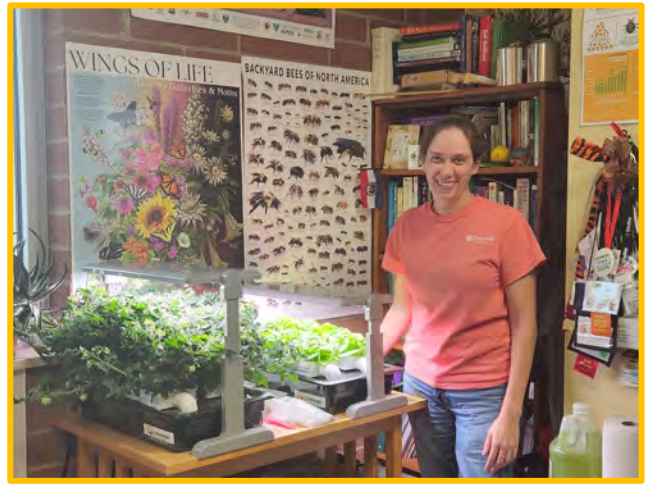
Desk top hydroponic units in my office, growing tomatoes, lettuce, kale, and bok choy. Hands-on learning about hydroponics allows me to better help clients.