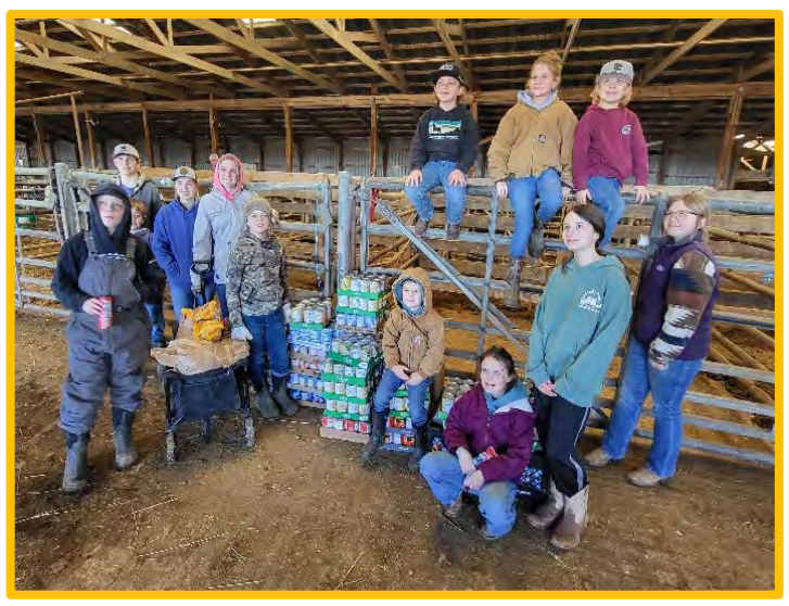
As responsible citizens, we promote generosity and community strengthening through service. 900 meals were donated in Washington County through the 4-H Feeding Missouri Initiative

During the 2022-2023 4-H year Washington County enrolled 84 members. Over 95% were engaged in science related projects and experiences. Approximately 150 exhibits in the exhibit hall and 78 animals in the Washington County Fair from 4-H members in Washington and Iron Counties and FFA members from Washington County, who are also supported through youth programing. The Sale of Champions brought in $215,842 for the local youth.