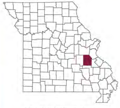
County population: 23,791