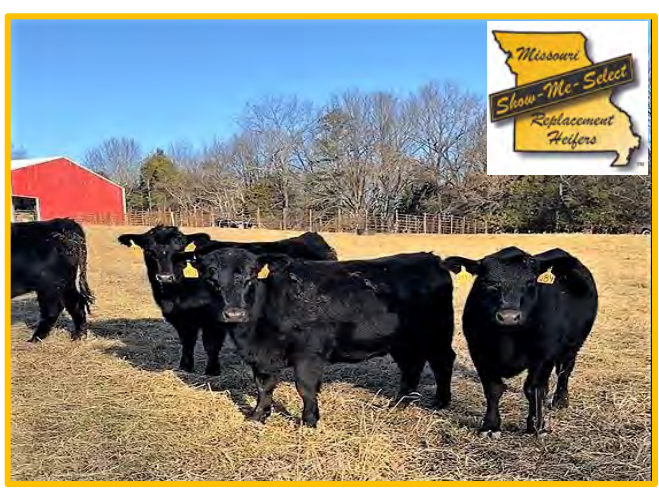
Show-Me-Select heifers consigned to the East Central sale.

This program reached 108 participants across Missouri. 35% of the participants were beginning poultry flock owners. Returned surveys from the program indicated 100% of respondents learned something from the program and can use the information on their operations.