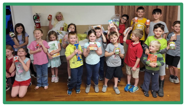
Food collection for 4-H Feeding Missouri

As responsible citizens, 4-H promotes generosity and community strengthening through service. Club and project leaders involve youth and teens in community service and leadership opportunities. During the 2022-2023 4-H Year, over 100 hours of community service projects were completed by 4-H members and volunteers during the 2022-2023 4-H Year. One such project is 4-H Feeding Missouri Initiative, in which 4-H participates in a friendly competition to raise the most meals for food insecure families through food drives, monetary donations and volunteering time at local food pantries. In Ste. Genevieve County, the equivalent of 860 meals were donated.