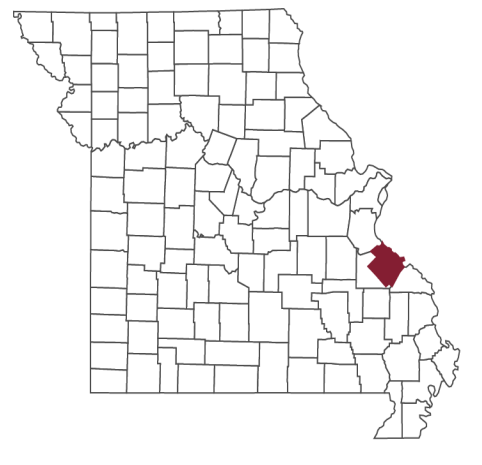
County population: 18,406