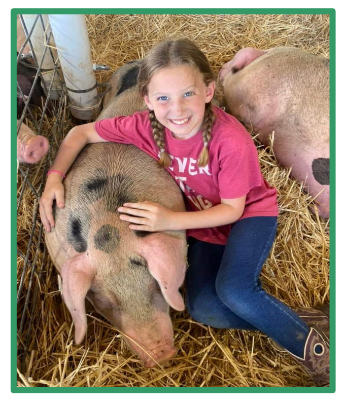
Proud 4-H member at the Washington County Fair

Another program of note is the Embryology program. During this program, students learn about the 21-day development occurring within a fertilized, incubated egg that can results in the hatching of a chick. Students learn how to identify the parts of an egg and discover what each part provides for the developing chick. Students learn how to tell if an egg is raw or boiled and explore the strength of the egg's shell providing protection to the developing chicks. Students review the necessity of hand washing due to potential contamination caused by salmonella in poultry and poultry products. Through this program, students often gain experience with death and disabilities. Throughout the experience, students are charged with rotating the eggs three times a day and are responsible for checking to make sure the incubator has water and is maintaining the correct temperature. Once the chicks hatch, the students care for them, providing feed, water, warmth, and a calm environment. In 2023, 15 students participated in the Hatching Chicks in the Classroom program. These students participated in over 15 hours of learning with the "Chick It Out" program.