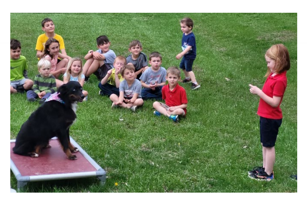
Dog training demonstration

Volunteers participate in development opportunities like project leader training and club leader summits, in addition to ongoing support from MU Extension youth faculty and staff gaining knowledge in how to offer a valuable learning experience for the youth they are working with while maintaining a safe, supportive environment.