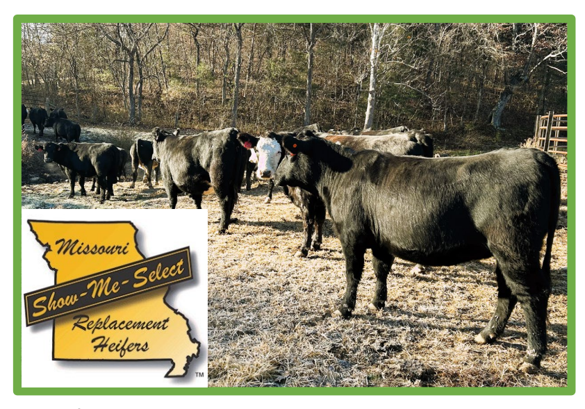
Heifers enrolled in the 2023 Show-Me-Select sale held at Farmington Regional Stockyards