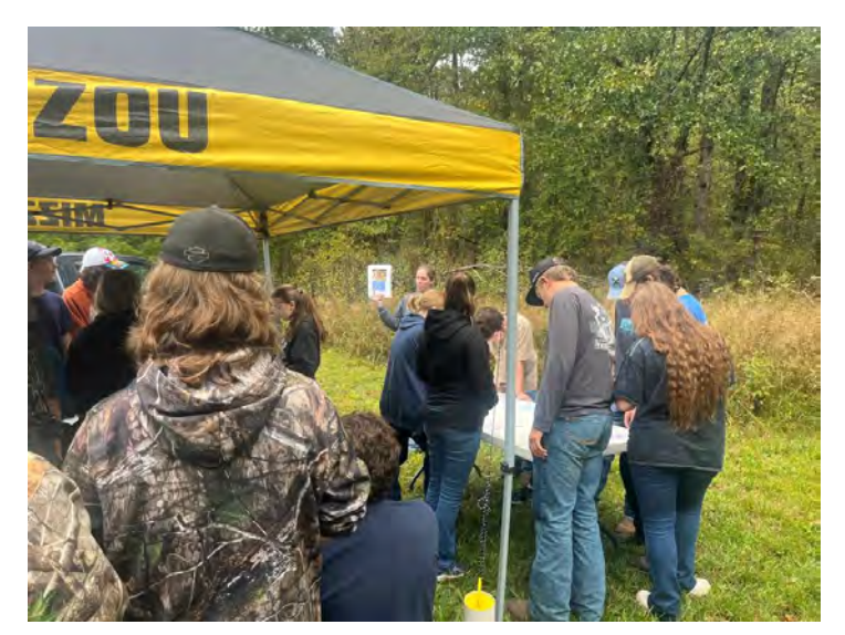
Bug Bingo with high school students to learn insect identification, pests vs. beneficial insects.