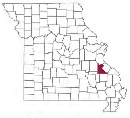
County population: 67,168