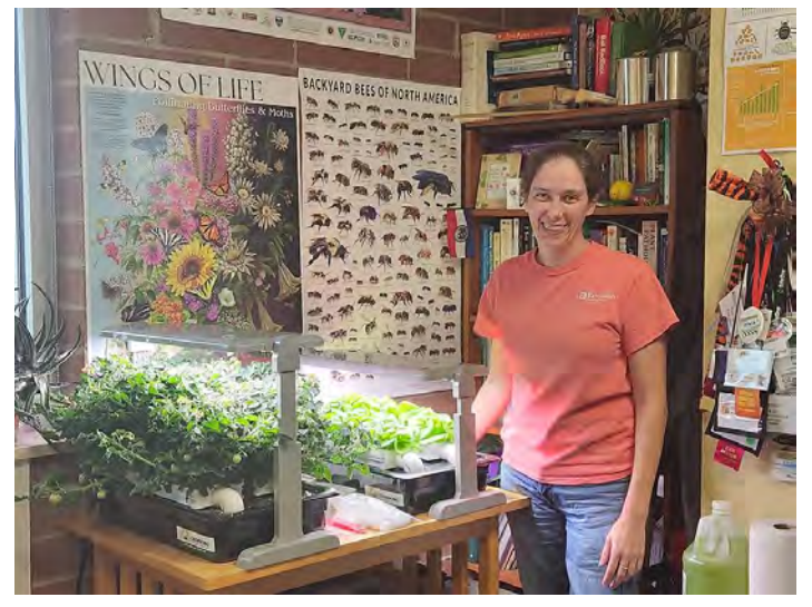
Desk top hydroponic units in my office, growing tomatoes, lettuce, kale, and bok choy. Hands-on learning about hydroponics allows me to better help clients.