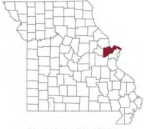
County population: 402,377