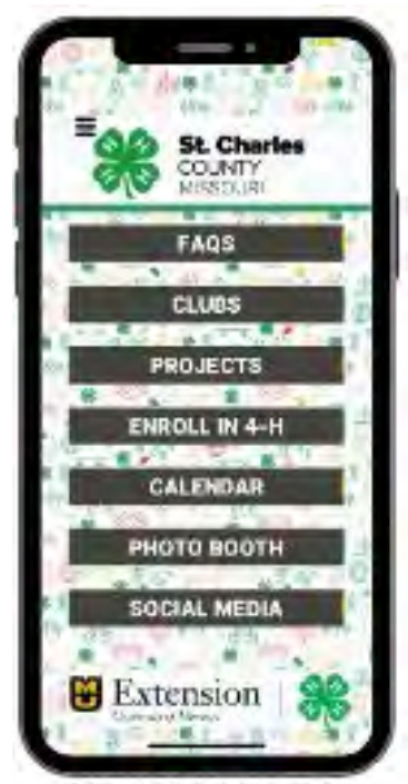
ST. CHARLES COUNTY APP