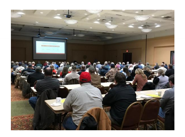
MU Crop Conference

The 2022 regional corn and soybean commodity conference was held at the Miner Convention Center during January. Participants from 19 MO counties, including New Madrid County, and two other states were presented research-based information in market outlook, commodity organization updates, corn disease management, weed management and herbicide resistance as well as soybean varieties and nutrient management.