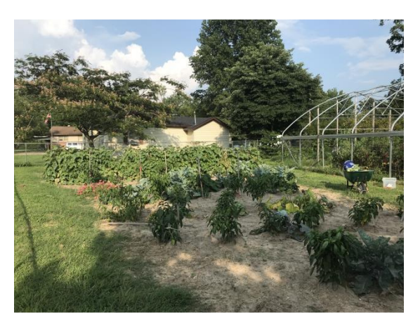
The community garden is used for FNEP in-service and community education. Produce used in food preservation workshops