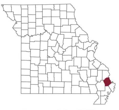
County population: 38,055