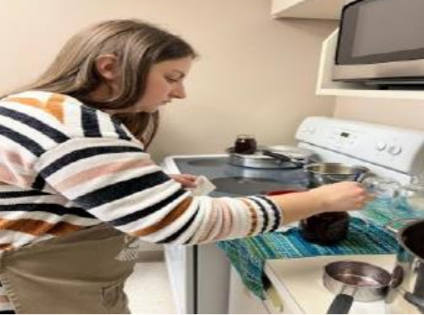
Hands-on Food Preservation workshops, that include fact sheets and answers to questions on canning, freezing, dehydrating and storing food products for long term storage.