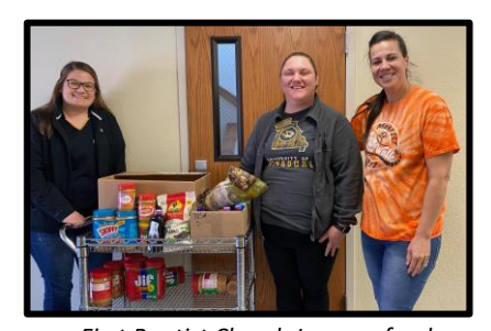
First Baptist Church January food donation.