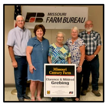
The Clarence and Mildred Grebing Farm was purchased in 1920.