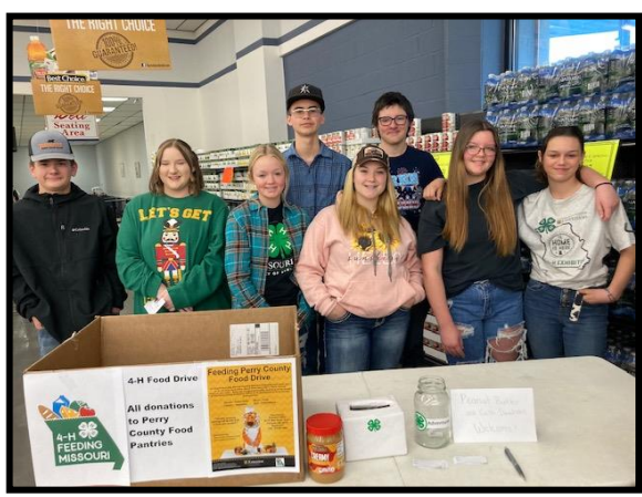
Perry County 4-H members fought hunger by raising over 16,000 meals for local families this year making the county eighth in the state 4-H Feeding Missouri Competition to fight food insecurity.