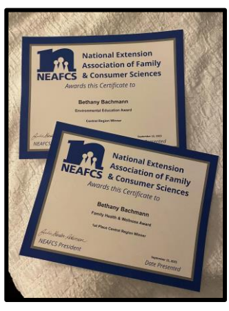
Environmental Education Award Central Region Winner

Family Health and Wellness Award - 1<sup>st</sup> Place Central Region Winner