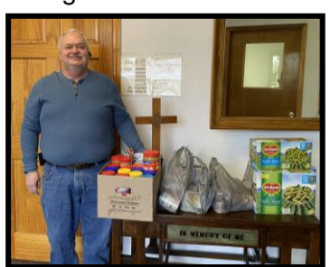
Perryville United Methodist Church food donation.