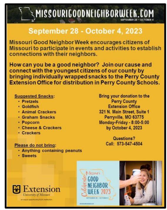
Good Neighbor Week promotional flier.

Snacks donated to the Perry County Extension Office during Good Neighbor Week.