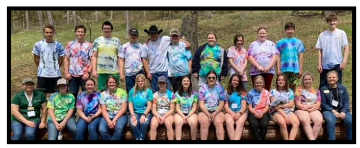
Seventy-three Perry County youth learned leadership, citizenship and life skills thru three camp experiences including Teen Retreat, SE Region Camp and Peaceful Valley 4-H Camp.

Perry County teens also demonstrated their leadership abilities by being selected to serve as two State 4-H Ambassadors, a delegate to National 4-H Congress, one as a winner of a Missouri 4-H Foundation College Scholarship, and attending State 4-H Teen Conference, State Congress, and Teen Retreat.