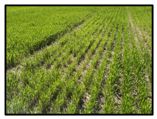
Perry County field visit.

A total of 231 agronomic soil tests were reviewed and 160 producers and homeowners were contacted through one-on-one education in Perry County.