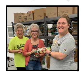
Ladies of Charity March and April Food Donation

Food was distributed to First Baptist Church who reach 240+ families monthly, Ladies of Charity who reach 120-200 families monthly and Perryville United Methodist Church where the food is put into their Little Free Food Pantry. Each organization was also given recipes to be distributed using the item of the month.