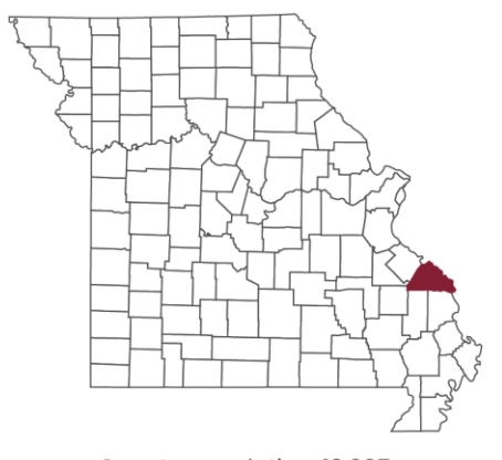
County population: 19,007