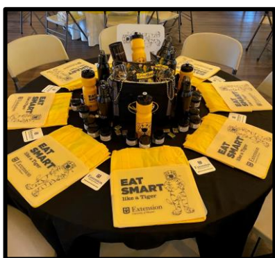
Perry County Extension's Table at the Chamber of Commerce's Annual Dinner

Each year community business and organizations are given the opportunity to sponsor and decorate a table for the Perryville Area Chamber of Commerce Annual Dinner. The Perry County Extension Council did this for the second time in 2023. The table theme was "MIZ-ZOU!" The group that sat at the table was super excited about all their Mizzou and University of Missouri Extension goodies.