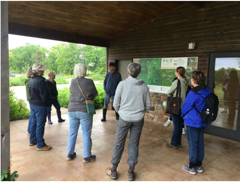
Participants of Master Pollinator Steward at Field Session in Prairie Garden Trust

Participants at Container Gardening Workshop in Cole County