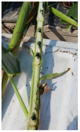
Left: Drought stricken corn shown here provides the possibility of high nitrate level that can be detrimental to livestock.