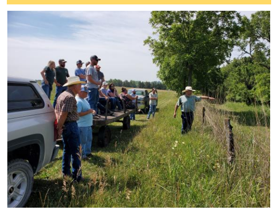
The Northwest Regional Grazing School, pictured above, is held each year at the MU Hundley-Whaley Extension and Education Center. Mercer County is invited to attend.

Pesticide applicator training helps reduce the harmful effects of improper pesticide use.