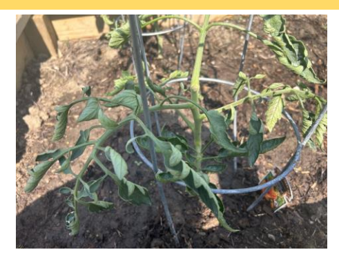
Above is a tomato plant with herbicide damage. Soil testing could offer insight to this issue.

In 2023 there were 66 field soil samples and 3 garden soil samples from Mercer County analyzed by the MU Soil Testing Lab.