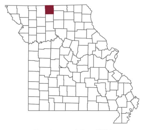
County population: 3,517