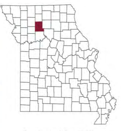
County population: 15,001

Timmons Farm MU Extension in: Livingston County