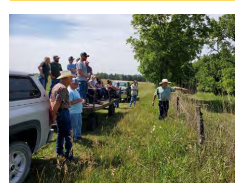
The Northwest Regional Grazing School, pictured above, is held each year at the MU Hundley-Whaley Extension and Education Center. Livingston County is invited to attend.

Pesticide applicator training helps reduce the harmful effects of improper pesticide use.