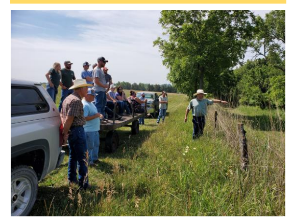
The Northwest Regional Grazing School, pictured above, is held each year at the MU Hundley-Whaley Extension and Education Center. Grundy County is invited to attend.

Pesticide applicator training helps reduce the harmful effects of improper pesticide use.