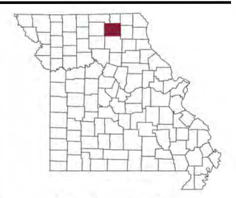
County population: 25,339