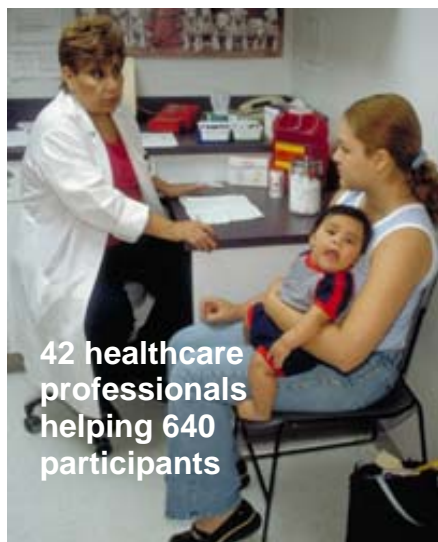
42 healthcare professionals helping 640 participants