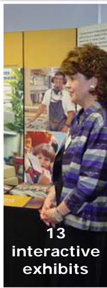
13 interactive exhibits