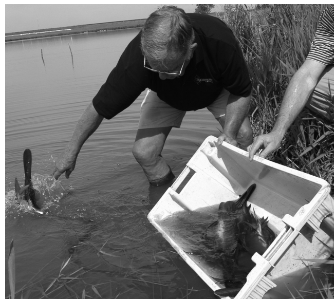
Figure 2. Stocking paddlefish fingerlings.