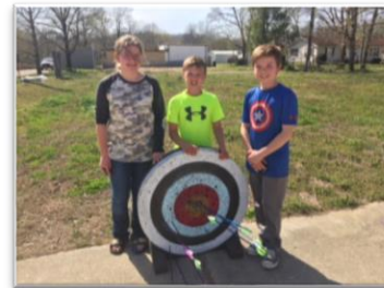
Carter County Shooting Sports