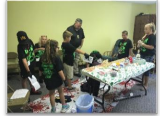
Rombauer Rascals new Pavilion 4-H'ers working on a crime scene at CSI camp