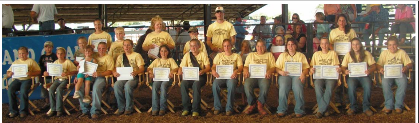
Cedar County 4-H Members receive their awards and recognition during the 2008 Land O' Lakes Youth Fair.

Cedar County 4-H members are supported by 69 youth and adult volunteers. Volunteers create, support and are part of the 4-H community. A national report suggests that the average volunteer in Missouri contributes 96 hours per year. Valuing their time at $17.19 per hour, based on average Missouri incomes, the contribution of Cedar County 4-H volunteers was worth more than $113,866.5 in 2008!