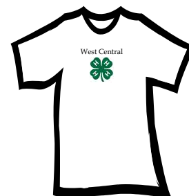
Front of Ash Gray T-shirt with Green 4-H Clover