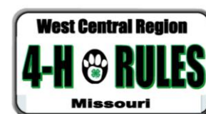
Image on back of T-shirt with Black & green writing and Green 4-H Clover

Show off your West Central Regional Pride and bring your $10 to order your shirt at the Energizer. $1 of each shirt will be donated to