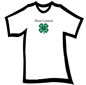
Front of Ash Gray T-shirt with Green 4-H Clover