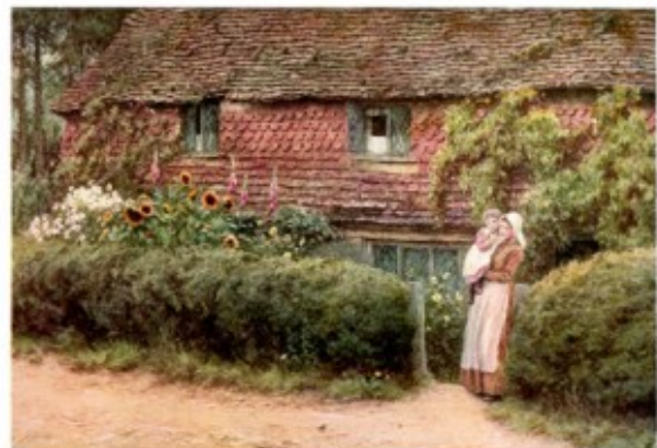
Artist depicts a traditional cottage garden - minimal and small with food, animals and essentials for survival.

In each case, design around how the space will be used and create areas with walls (shrubs and perennials), ceilings (trees or arbors) and a floor (grass or rock). Select plants based on the chosen theme but continue to work for year long interest and use plants that inspire and relax.