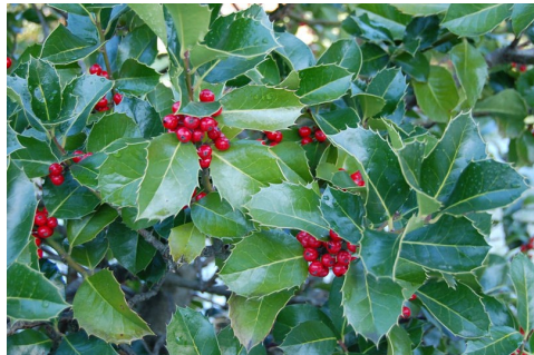
Wilson holly (below). Koreanspice viburnum.

Common evergreens that grow well in southeast Missouri include shortleaf pine, eastern red cedar, Chinese juniper, Japanese yew, Wilson holly and English boxwood.