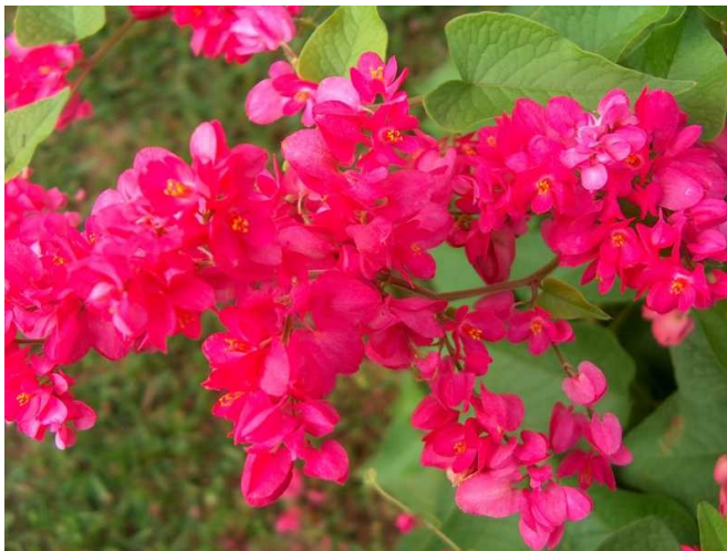
Coral Vine, also known as chain of love, confederate vine, love vine and Queen's wreath, can grow up to 10 feet in our area in one season.

Aggressive flowering vines that can grow 30 to 50 feet include: grape (Vitis), wisteria (Wisteria), trumpet creeper (Campsis), sweet autumn clematis (Clematis ternifolia), climbing hydrangea ( Hydrangea anomala ssp