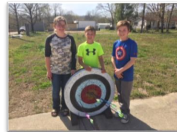
Carter County Shooting Sports