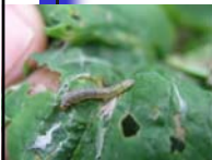
Strawberry Leaf Roller