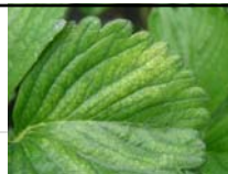
Two Spotted Spider Mite