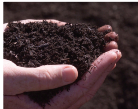
TOP: A pile of fallen leaves will decompose during winter and provide a good mulch for your beds. ABOVE: After decomposition, leaves will improve the texture and quality of your garden's soil.