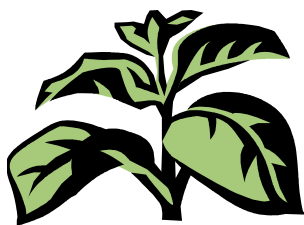
Basil ( Ocimum basilicum )

For more on Basil go to: en.wikipedia.org/wiki/Basil