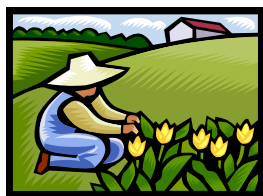
Missouri Cut Flowers: From Field to Market

September 5, 2007, MSU-Mountain Grove, MO Campus. This all day event is presented by "Grow Native" & "State Fruit experiment Station."