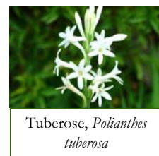
Tuberose, Polianthes tuberosa