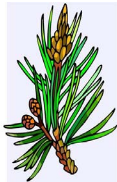
Plant of Merit: Colorado Spruce; Picea pungens "Fat Albert"