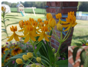
Different colors of annual butterfly weed

curassavica ). I have always had the perennial form ( Asclepias tuberosa ) and have had relatively no real major pest issues except for some bugs that gather on the seed pods once the flowering is over - no big deal for me. The one observation is that in my 8 years of growing the A. tuberosa , I never had one single Monarch caterpillar.