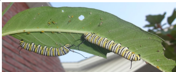
Monarch Butterfly Caterpillars

During my years of living here, I had never seen a Monarch on the property. Now we were finding Monarch caterpillars. I was thrilled but sure not as thrilled as my girls. For days they checked on them.