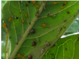
Aphids on Annual Butterfly Weed parasitized by tiny parasitoid wasps.