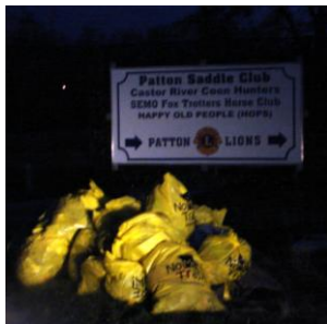
Big pile of trash – courtesy of the 4H Rodeo Club, Hwy. 51 North.

Tuesday, May 17 - Country Club 4H meeting & trash pick up - 6:00 pm, Marquand Day Care