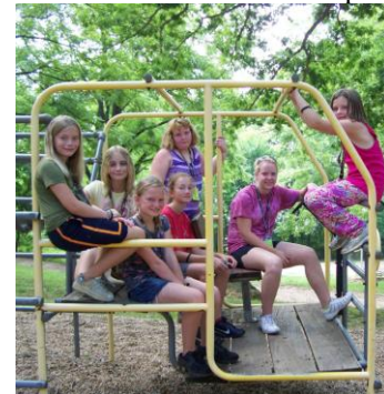
Scene at Heartland 4H Camp ..

Money raised will be used for the Kids Helping Kids Fund, the state-wide 4H Fund that provides a monetary gift to 4H families in crisis-illness-fires-etc.