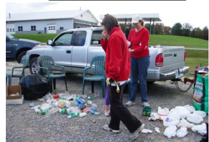
Whole lot of trash stompin' at the Leopold KC Hall Oct. 17.