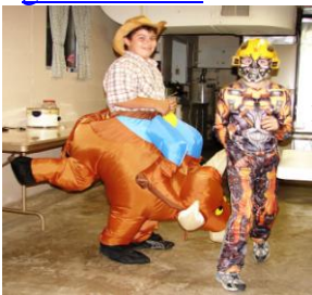
A Halloween moment at Cheerful Workers ‘ meeting.

http://www.4h.missouri.edu/programs/move/