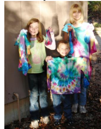
Sunny day, smiles & tie-dyed t-shirts (and socks)