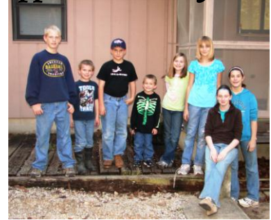
Motley crew .....