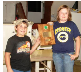
Cheerful Workers Beef Project members won the 2009 SEMO Fair Traveling Herdsmen Award!