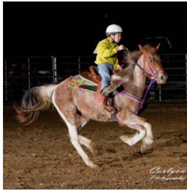
Chelsea ‘gittin’ ‘er done!’