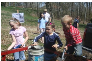
Leopold 4H members planted trees March 22 nd at the Leopold Picnic Grounds.