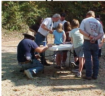
A Good Time was had by all! A BIG thank you to everyone involved!