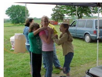
Rodeo Club members & a couple Stoddard County 4-H'rs spent the day helping out at a St. Jude's Trail Ride in Daisy. Fun Fun Fun