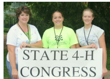
Leopold Members at State Congress.