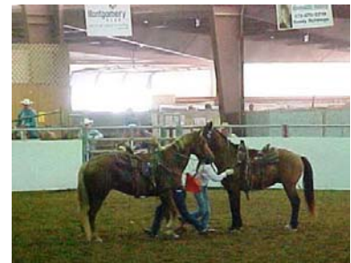
The Bakers doing the Chinese Fire Drill at the Cape County rodeo.