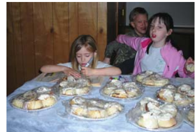
Leopold 4-H members sell cinnamon rolls at the 4-H breakfast.