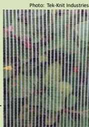
Insect netting can exclude SWD