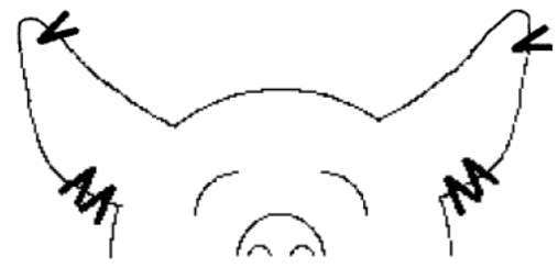
Litter # 11 - Pig # 5