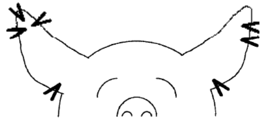
Litter # 94 - Pig # 7