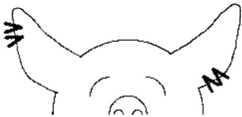
Litter # 6 - Pig # 2